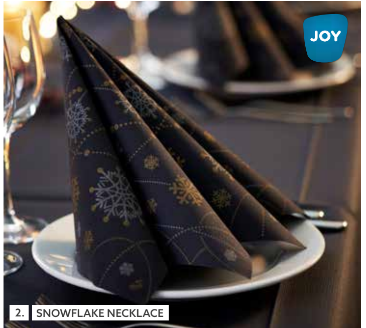
2. SNOWFLAKE NECKLACE