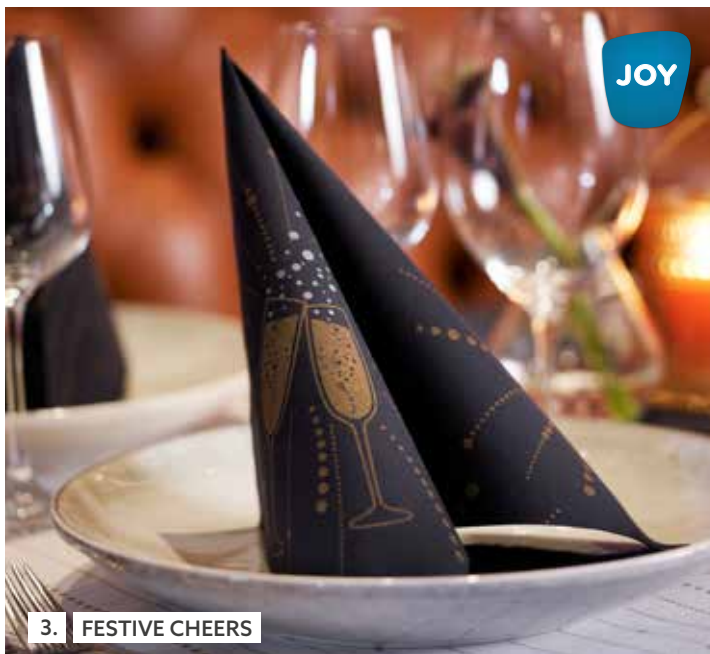
3. FESTIVE CHEERS