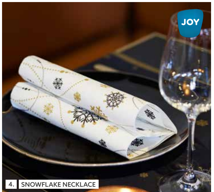
4. SNOWFLAKE NECKLACE