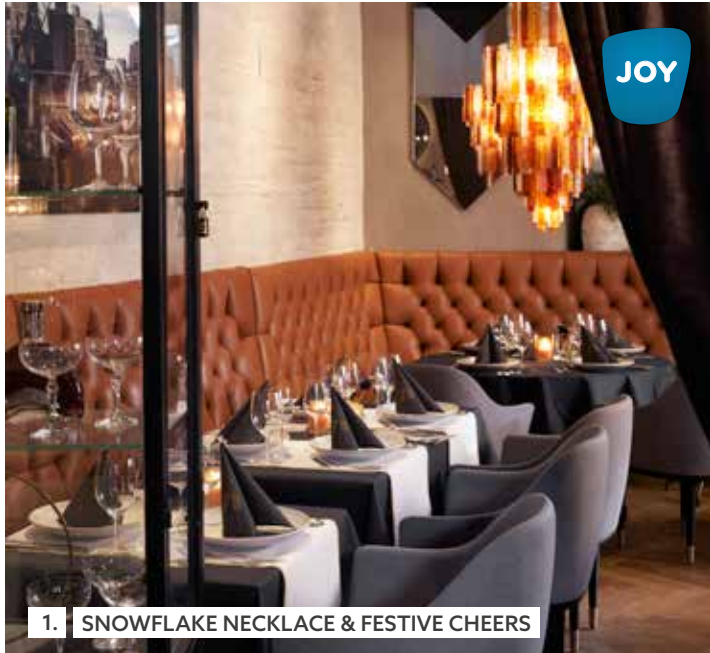
1. SNOWFLAKE NECKLACE & FESTIVE CHEERS